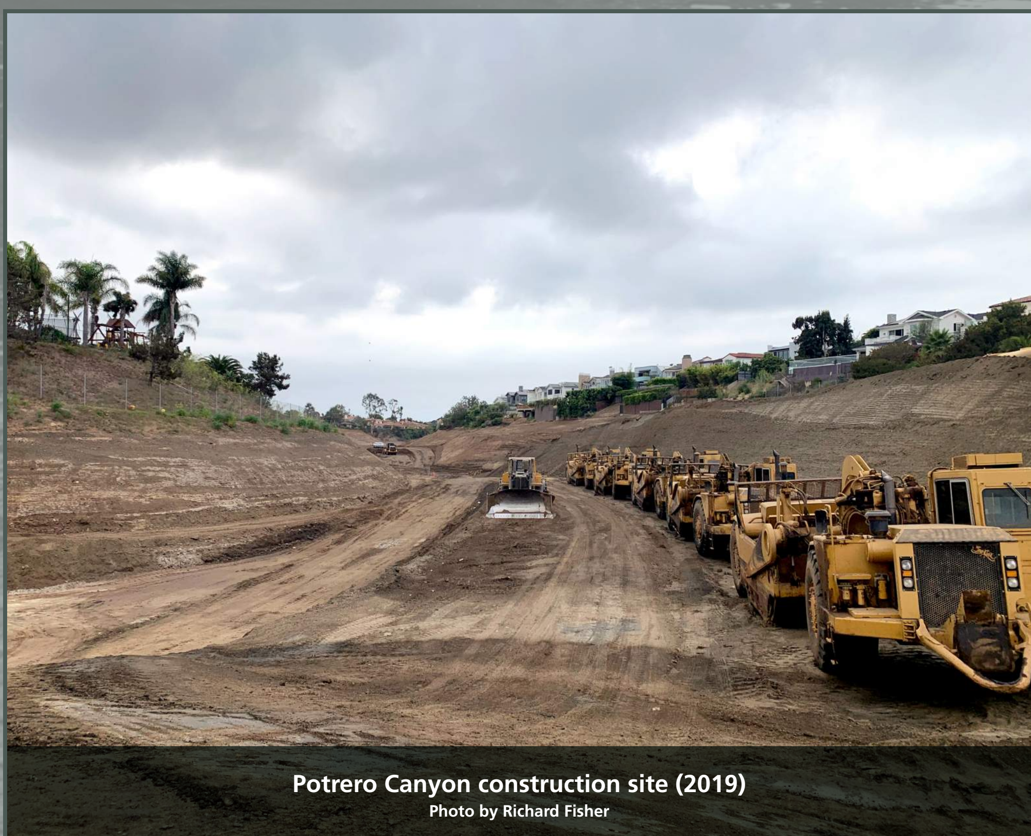
Potrero Canyon construction site (2019)