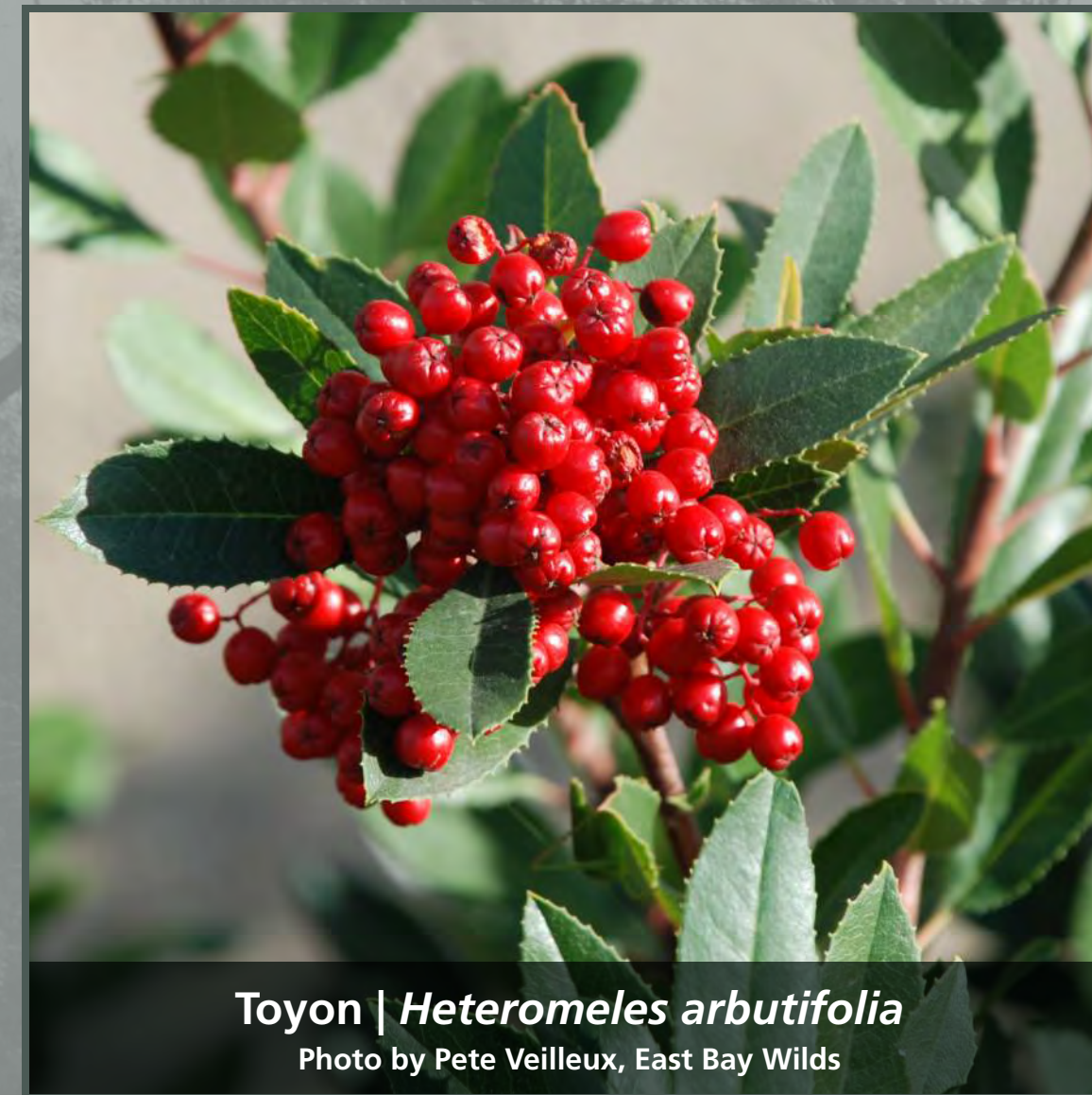
Toyon | Heteromeles arbutifolia