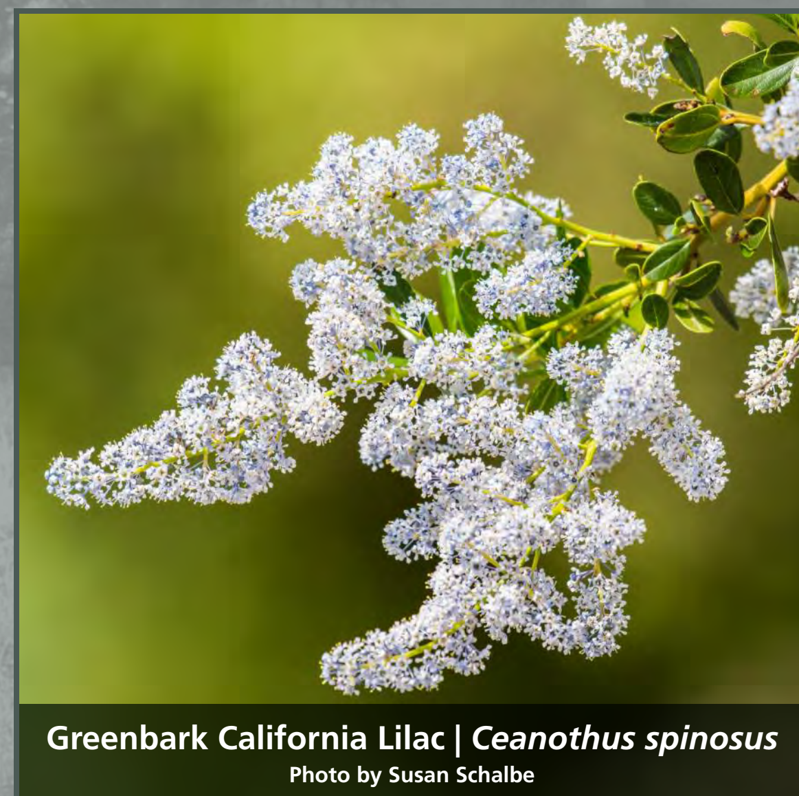
Greenbark California Lilac | Ceanothus spinosus