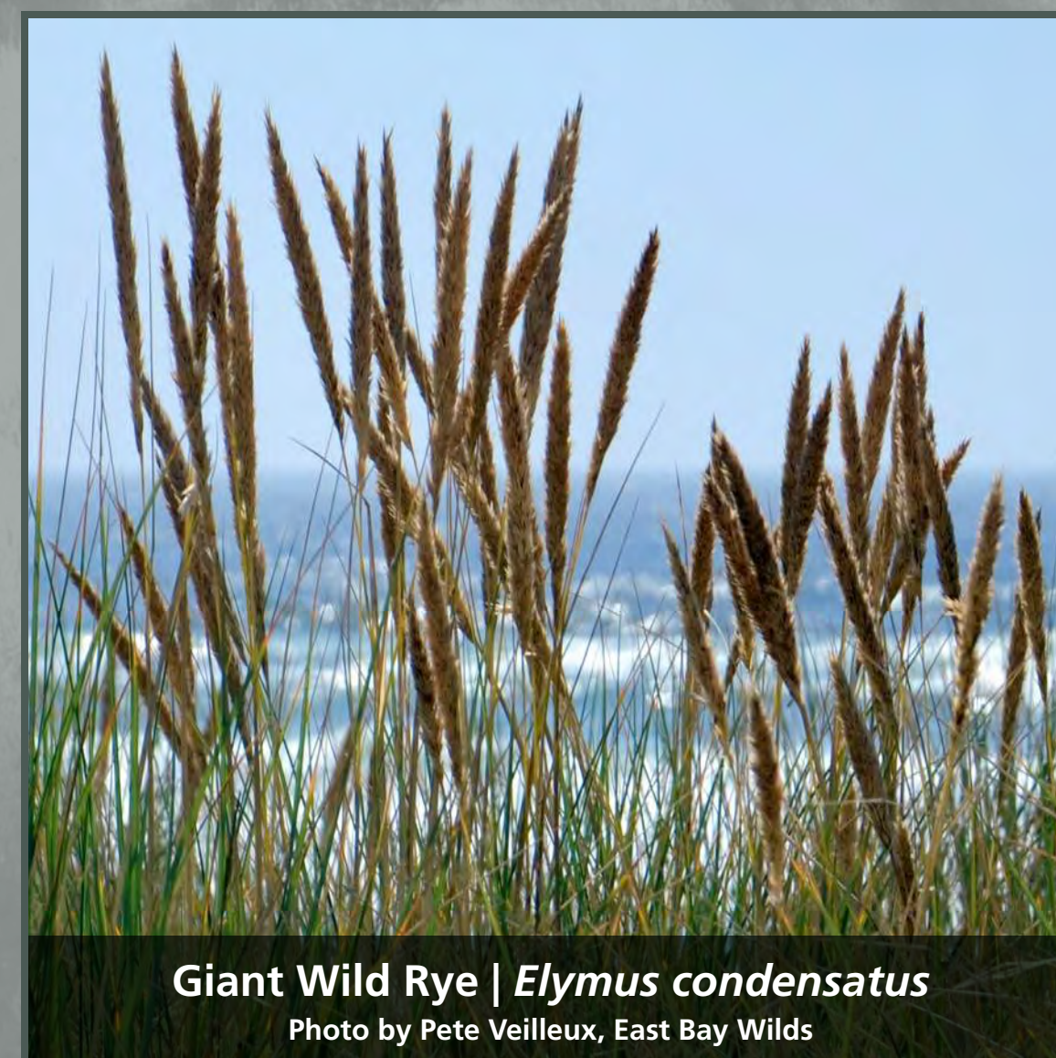
Giant Wild Rye | Elymus condensatus