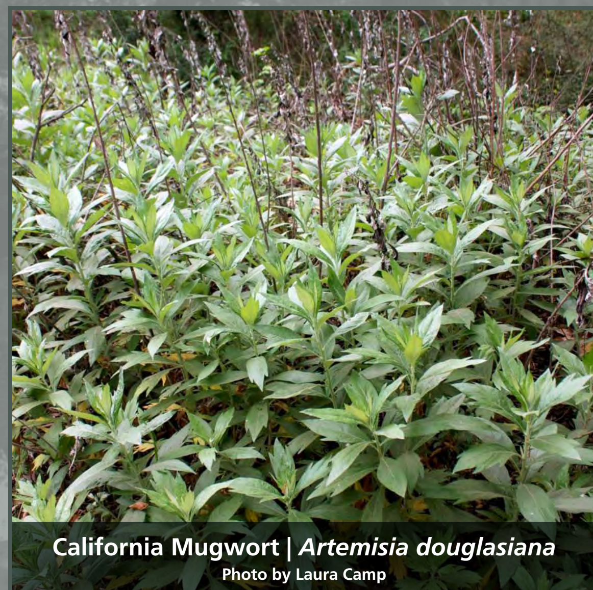
California Mugwort | Artemisia douglasiana