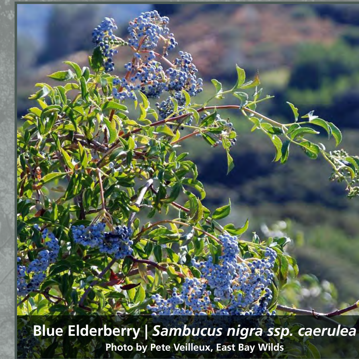
Blue Elderberry | Sambucus nigra ssp. caerulea