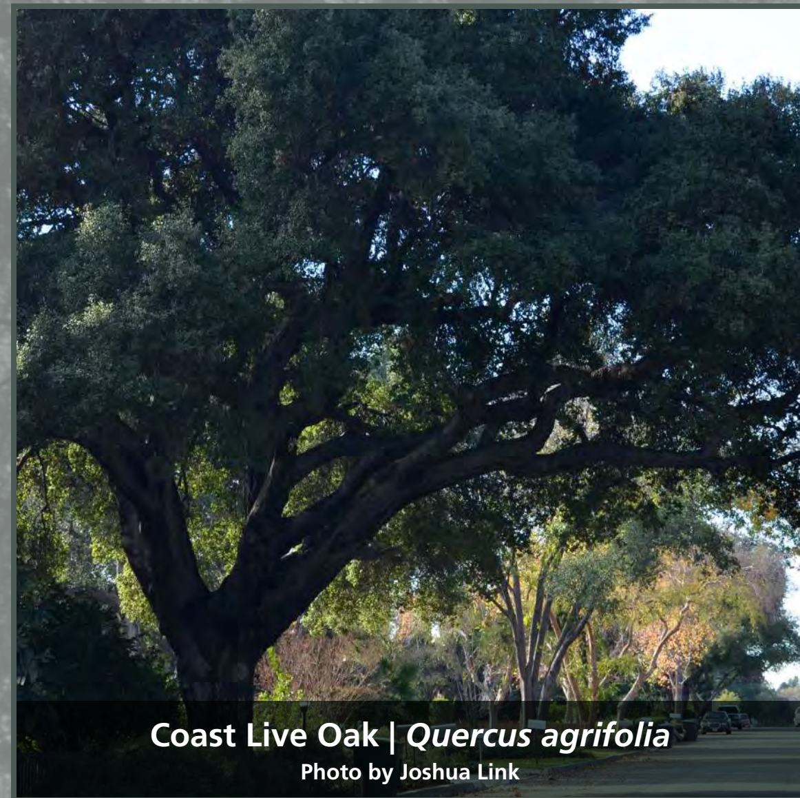
Coast Live Oak | Quercus agrifolia

Este variado bosque de árboles y arbustos nativos estabiliza las laderas con una densa red de raíces y proporciona refugio y alimento a la fauna. Muchas especies dependen del festín de bellotas, nueces, bayas, semillas, hojas y néctar que proporcionan los robledales. Una compleja red alimentaria con aves, mamíferos, reptiles, insectos y demás es posible gracias a la versión silvestre de un pasillo de productos bien surtido.