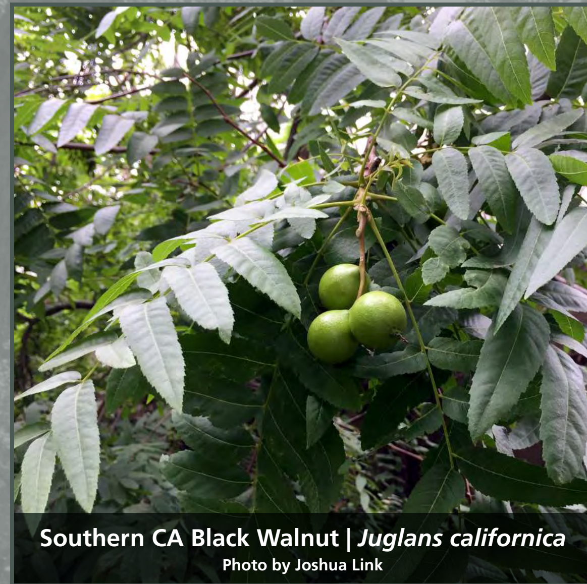
Southern CA Black Walnut | Juglans californica