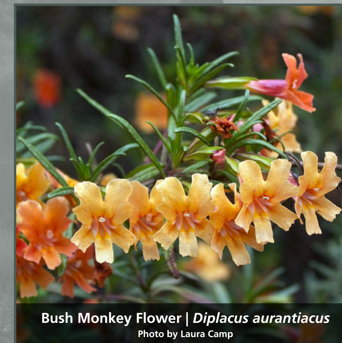
Bush Monkey Flower | Diplacus aurantiacus