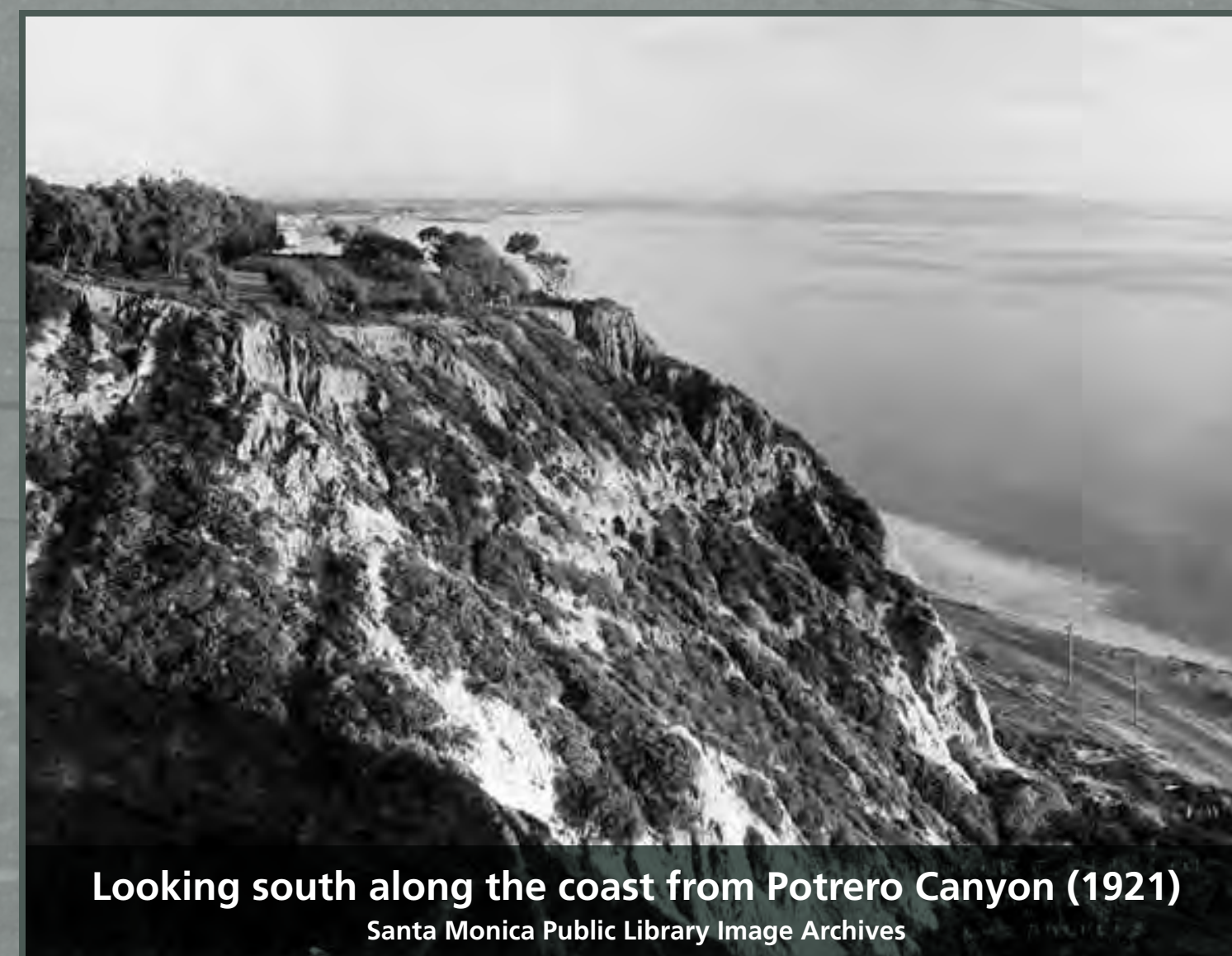
Looking south along the coast from Potrero Canyon (1921)