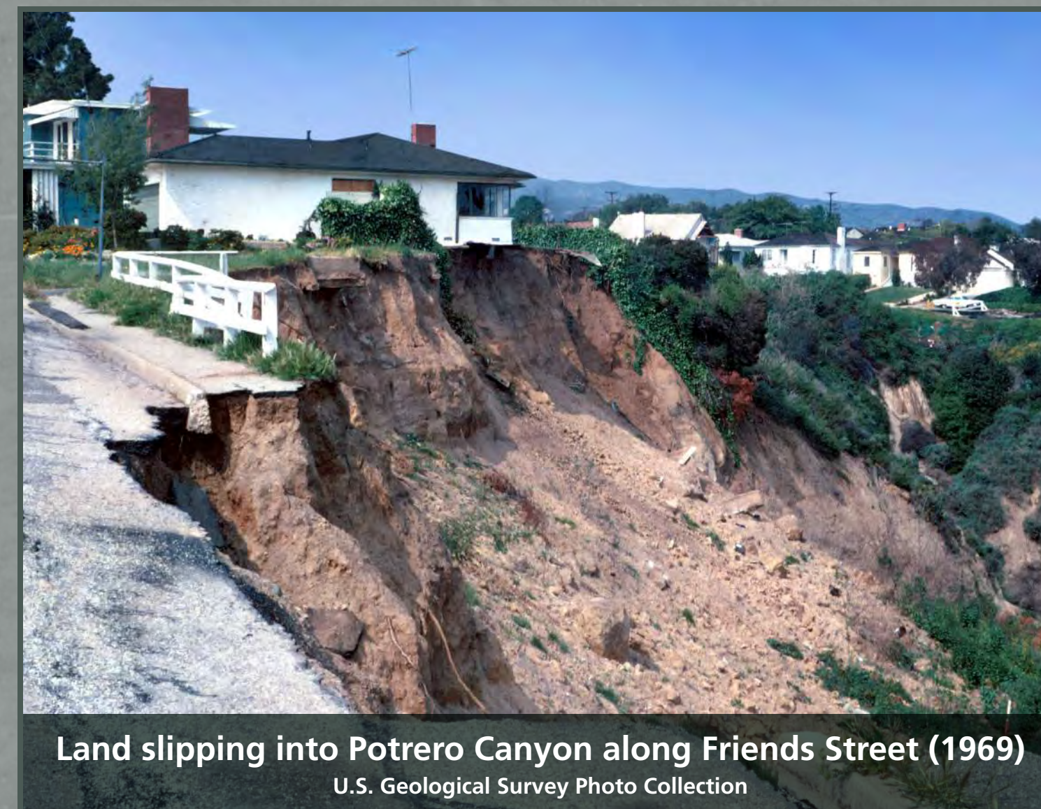
Land slipping into Potrero Canyon along Friends Street (1969)