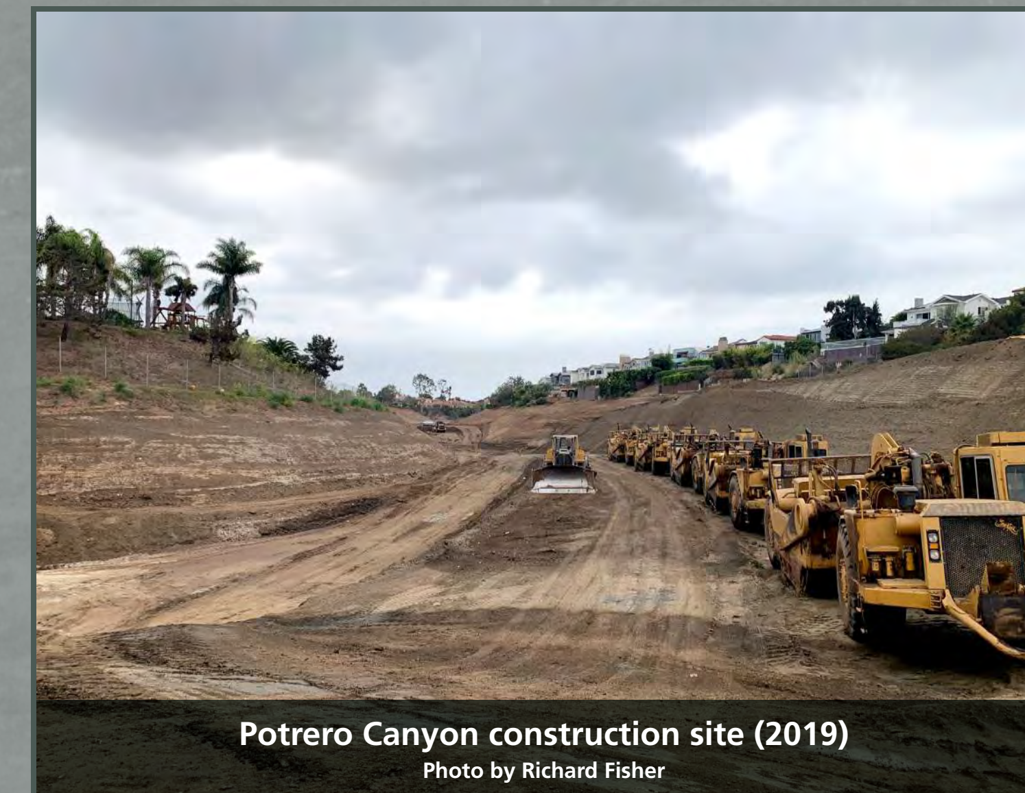
Potrero Canyon construction site (2019)