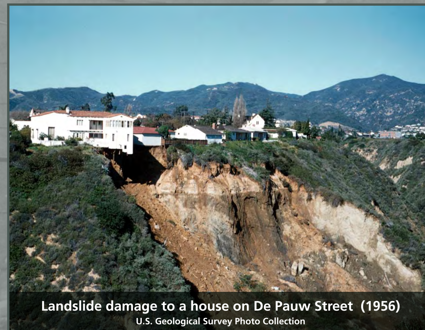
Landslide damage to a house on De Pauw Street (1956)