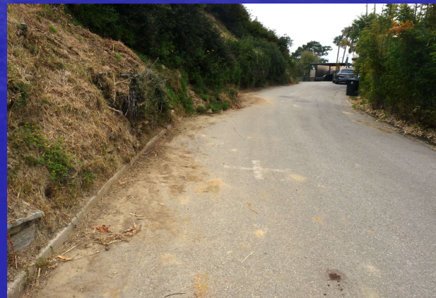
18 foot wide "Revello Chokepoint"