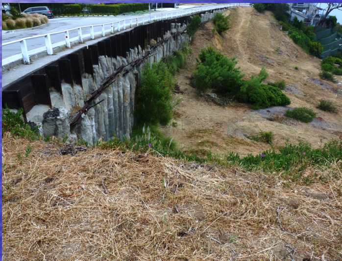
Reinforcement added in 1990s