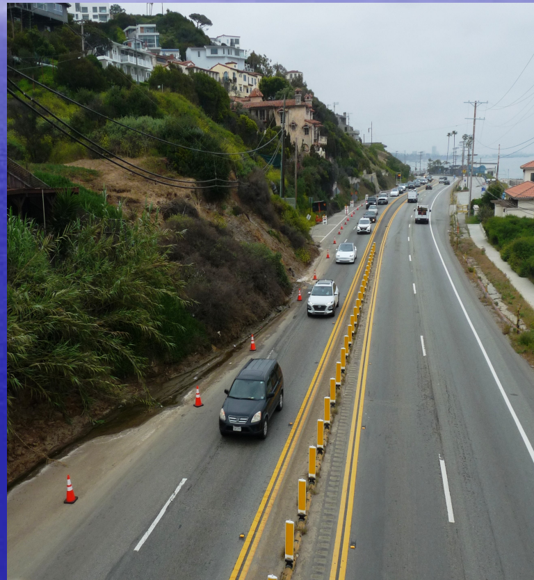
May 9 2024