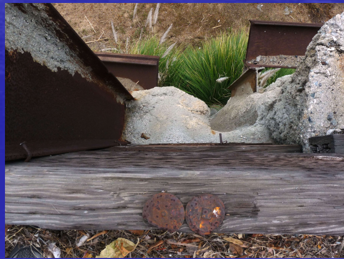
About 35 foot drop