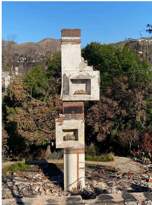
Mid-Century Modern Chimney with Two Asymmetrical Fireplaces, 1952, El Medio Bluffs.