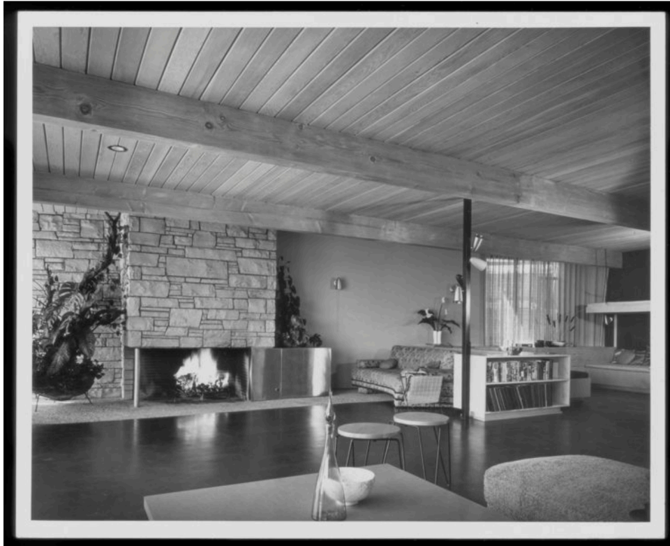
Richard Neutra, Kesler House, 1954.