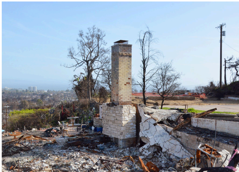
Richard Neutra, Kesler House, 2025.