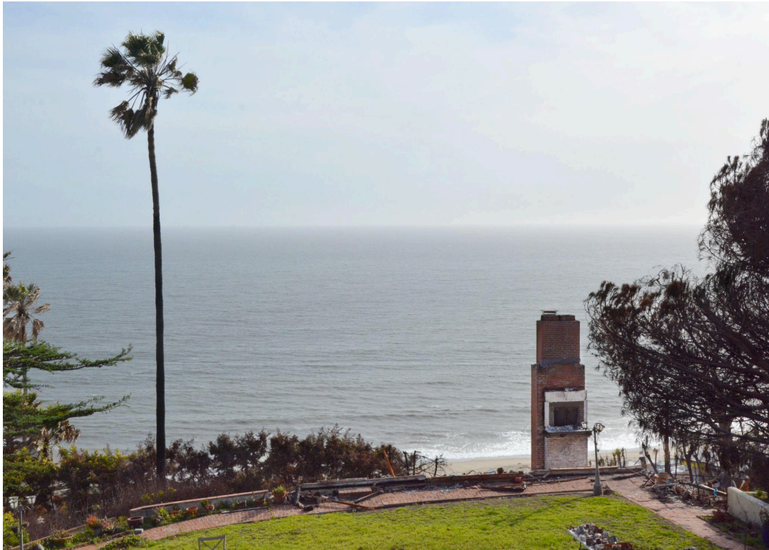
View from Las Casas, Pacific Palisades, CA. March 28, 2025.

Los Angeles, CA – House Museum advances Project Chimney , an initiative to catalogue, relocate, and memorialize a selection of historically significant chimneys in the Pacific Palisades burn zone. Designed by master architects Frank Lloyd Wright Jr. , Paul R. Williams , and Richard Neutra , surviving chimneys capture a glimpse of the architectural DNA of Los Angeles . The initiative is supported by the Pacific Palisades Preservation Coalition and Los Angeles Conservancy .